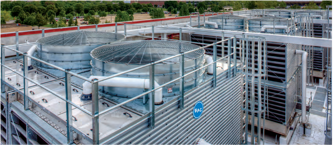
The Blue Waters Super computer at the University of Illinois is cooled by cooling towers.

Many universities, college and corporate campus's are faced with unique challenges in today's complex marketplace. Increased energy and operating expenses continue to pose a problem, but there is a solution that can provide savings and supports the trend to be more "Green". The addition of a campus cooling plant, will provide more efficient cooling to campus buildings. Basically, this means you will be able to provide cooling only to the buildings that need it and will not be wasting energy by pumping large amounts of cooling water through the miles of piping around your installation.