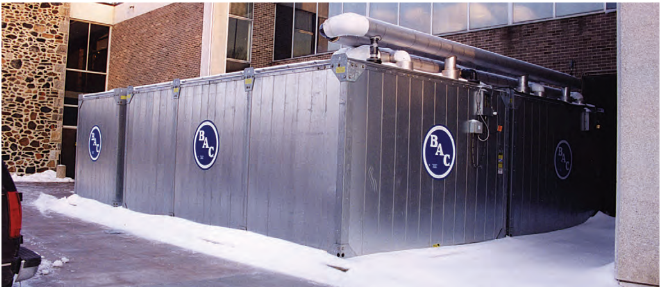
Ice Thermal Storage tanks at Catonsville Community College in Catonsville, MD, just outside Baltimore.