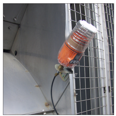
Automatic Bearing Greaser

A complete list of BAC Sales Representatives is available at www.BaltimoreAircoil.com . Call your representative and request your Automatic Bearing Greaser today.