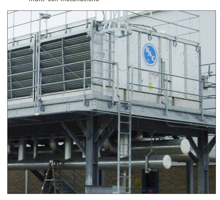
Bottom Inlet EASY CONNECT® Piping Arrangement Installation