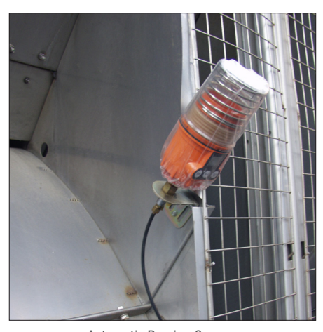
Automatic Bearing Greaser