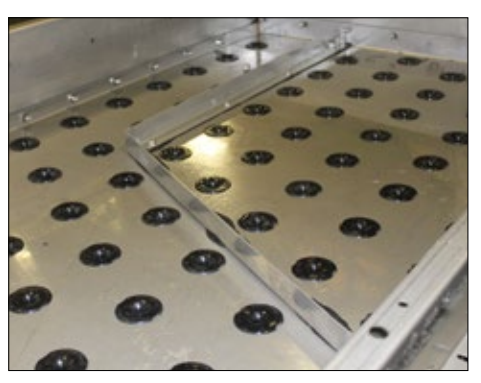
Gravity Distribution System Hot Water Basin

Pressurized spray distribution systems, installed on counterflow cooling towers, closed circuit cooling towers, and evaporative condensers, feature a series of PVC branches or pipes fitted with spray nozzles mounted inside the tower above the fill. These systems typically require 2 to 7 psig water pressure at the water inlet and require the unit to be out of service for inspection and maintenance.