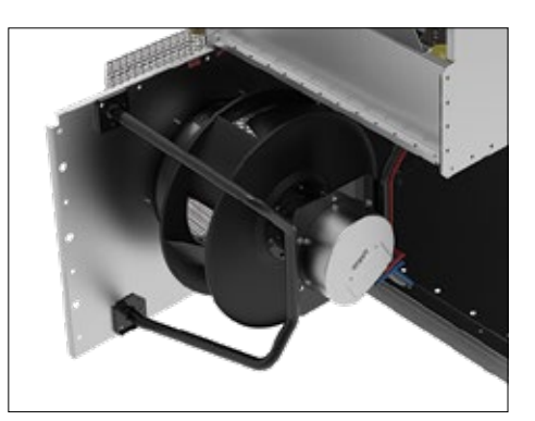
EC Fan System