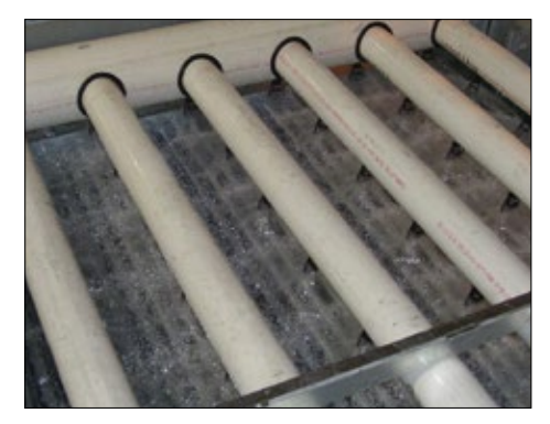
Pressurized Spray Distribution