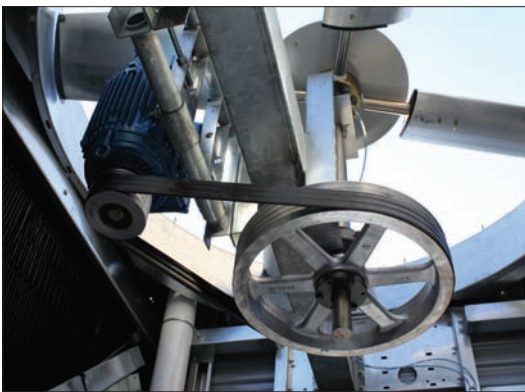
BALTDRIIVE® Power Train

Designed for ease of ownership, the Series 3000 and Series 1500 Cooling Towers include more maintenance friendly features than any other evaporative cooling product on the market. By simplifying regular service for a unit, the entire cooling system operates more efficiently and with an increased life expectancy.