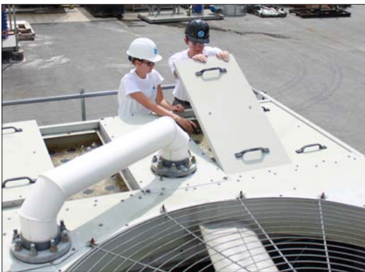
Easy Access to the Water Distribution System

When specifying a new or replacement unit, consider the following standard and optional features that make these products unique: