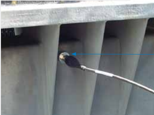
Figure 1a. Accelerometer Location - Gear Drive

• Correct accelerometer location, 1" from the edge of the box beam