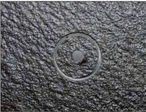
Figure 6. Scored TriArmor® Corrosion Protection System

The following are installation instructions for adding new field connections (Equalizer/Bypass/Outlet) on a cold water basin with the TriArmor® Corrosion Protection System.