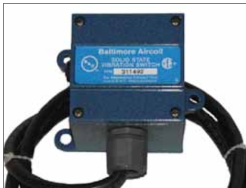
Figure 5. Electronic Vibration Cutout Switch

An important feature of the vibration cutout switch is the built in time delay. This prevents triggering of the alarm or shutdown functions from transient increases in vibration levels. It also avoids shutdown due to transitory vibrations occurring during start-up. Three second alarm trip delay is standard, however time delays are independently adjustable in the field over a range of 2 to 15 seconds.