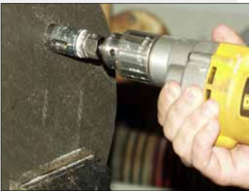
Figure 7. Removal Material