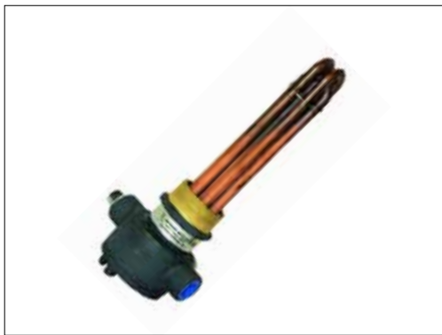
Figure 3. Basin Heater

Ensure that the heating element is completely submerged before energizing the main disconnect. For installations that have a BAC Controls Enclosure, please contact your local BAC Representative. For installations that use a stand alone BAC heater control panel, see below.