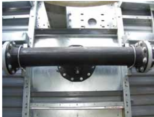
Figure 2. EASY CONNECT® Piping Arrangement