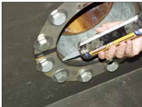
Figure 8. Caulk Exposed Galvanized Steel